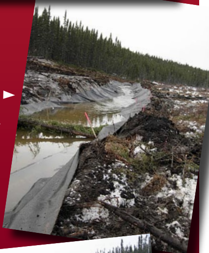
Preparations for installation of six-foot-diameter culvert at first stream crossing.