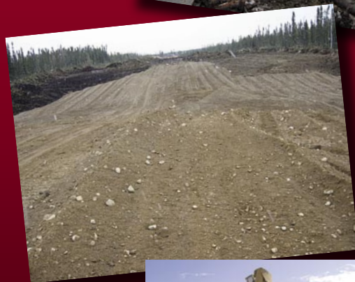
Installing granular core on a seven- kilometre stretch of the Wuskwatim access road is a major focus of current construction activity.