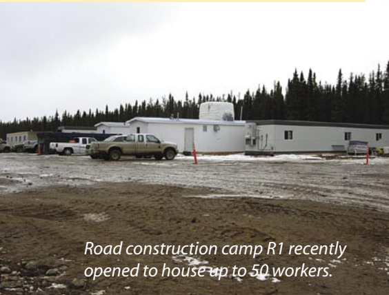
Road construction camp R1 recently opened to house up to 50 workers.