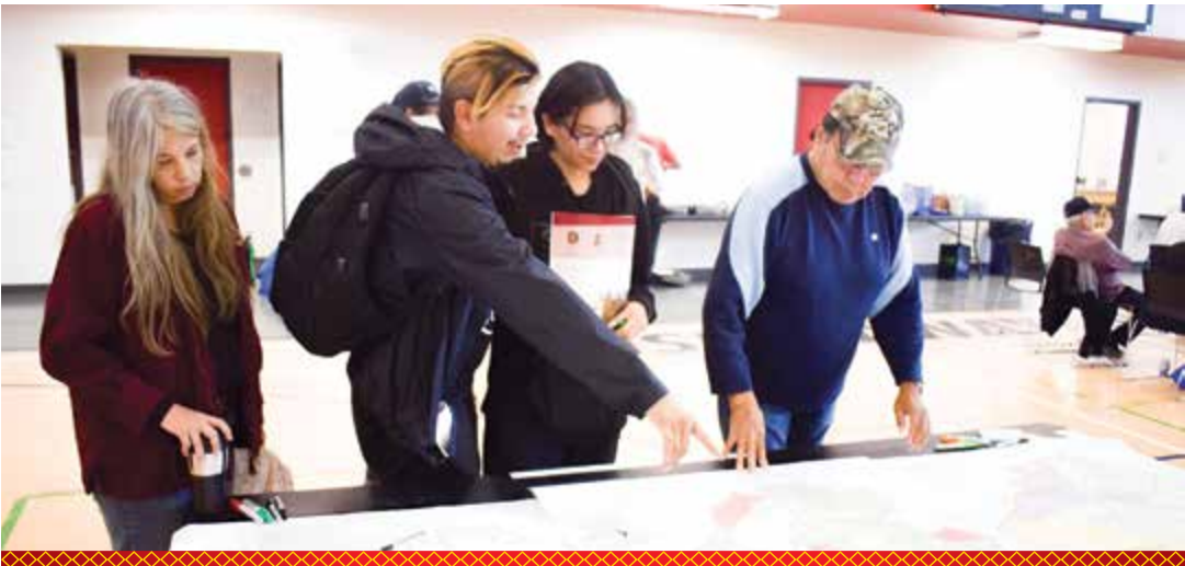
LUP Community Presentation, April 3, 2025.