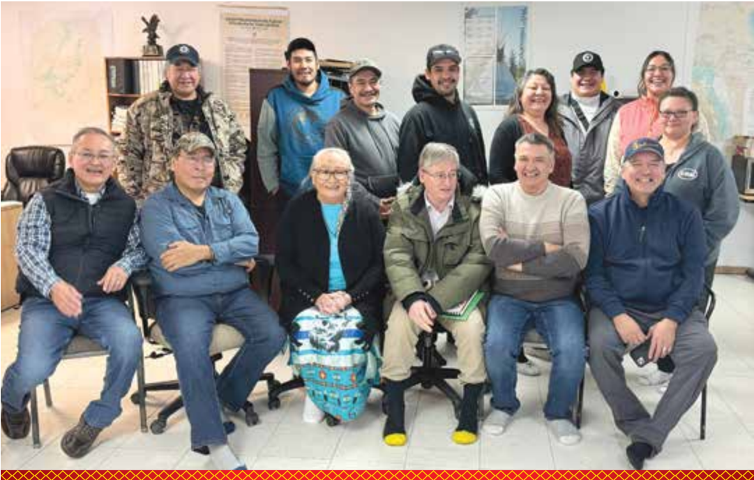
LUP Meeting with Elders, Land Guardians and Planning team, Feb 12, 2025.