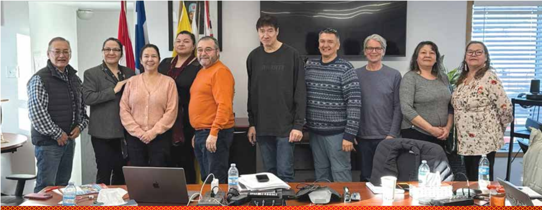
LUP Presentation for Chief and Council, Feb 12, 2025.