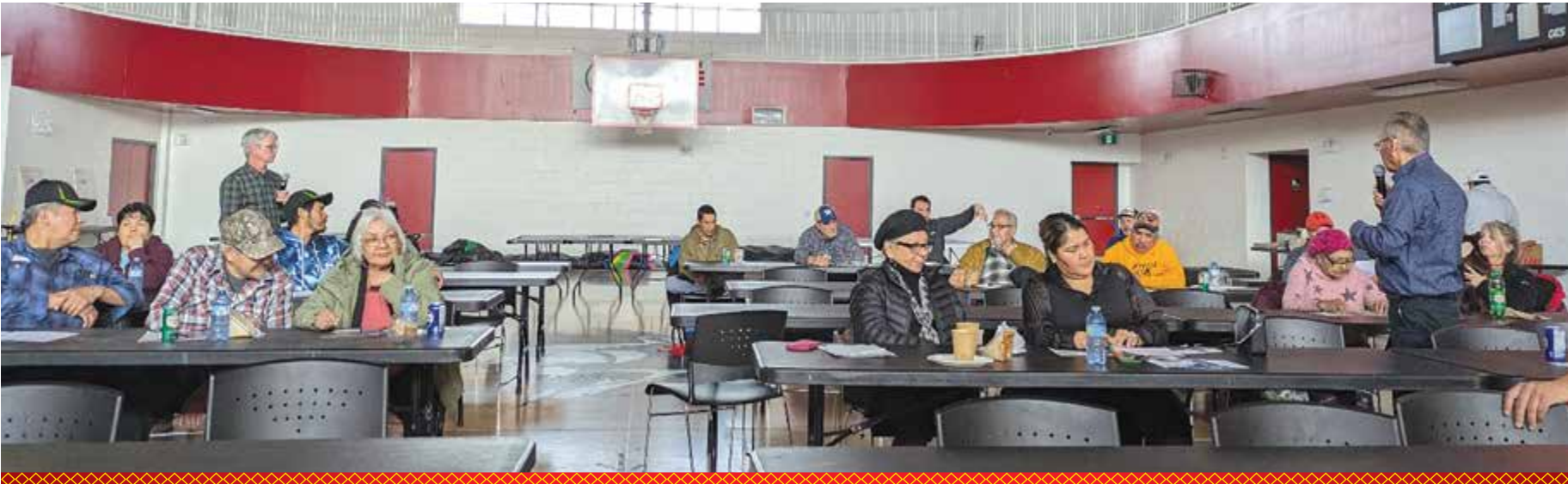
LUP Community Presentation, April 3, 2025.

while honouring the interconnectedness of everything.