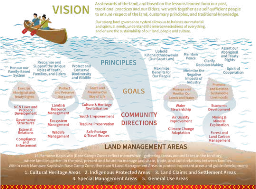
Vision diagram from the LUP.

After signing the Northern Flood Agreement (NFA) in 1977, NCN worked with the Province of Manitoba and Manitoba Hydro to collaboratively develop a Land Use Plan (LUP) for our land. However, nearly 40 years of planning via this process yielded no results; so, in 2014 our Nation reclaimed the planning process according to our ways, priorities and laws. Today, in 2025, our work has resulted in a finalized draft of the aski apacihikowi othascikiwin (Land Use Plan to benefit the Future).