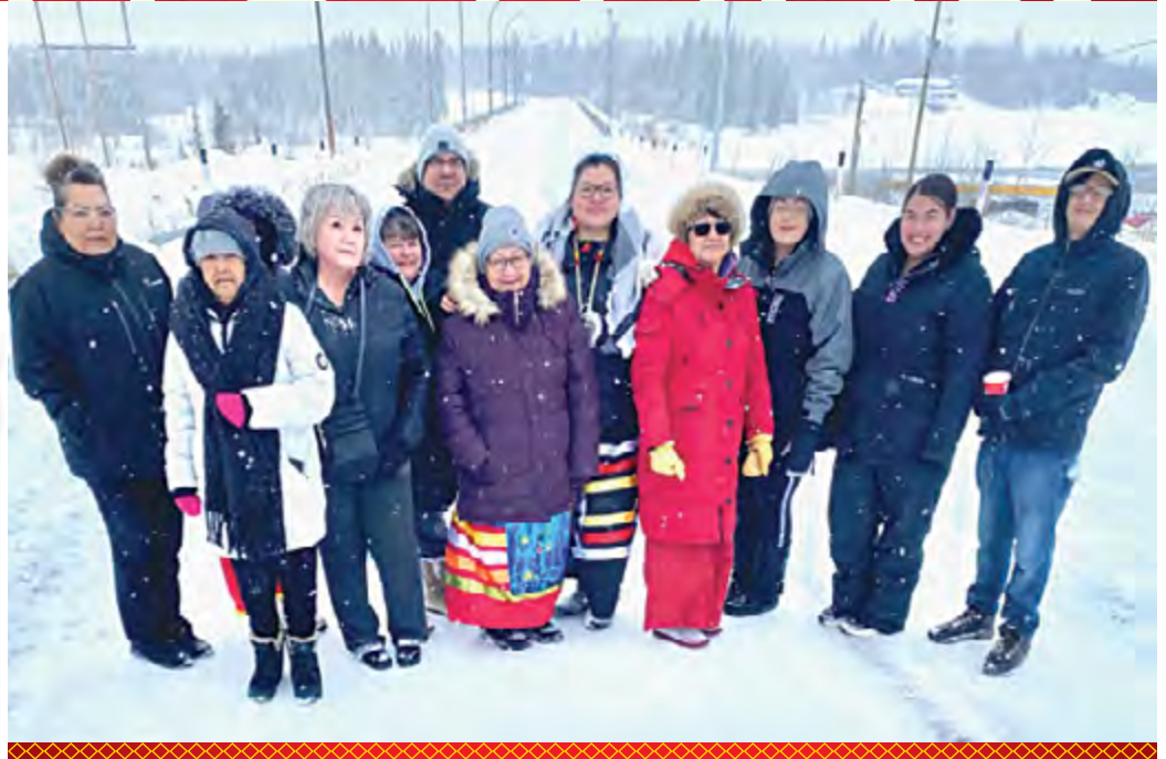
A ribbon removal ceremony, sponsored by MKO, was held on the Miles Hart Bridge on March 3rd showing respect to MMIWG.