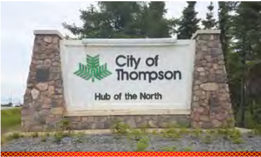
The old Thompson City Signs will be replaced with ones displaying recognition to NCN's Urban Reserve and new city logo.

The well-known welcome signs at the southern and northern ends of Thompson, Manitoba are expected to be updated this summer and NCN will be recognized.