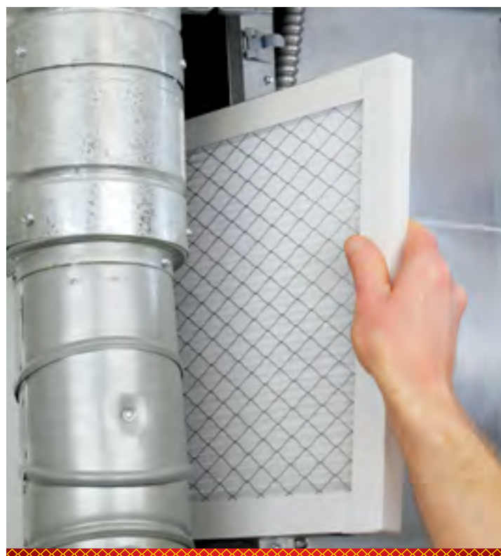
Change your furnace filters each season every year.

Improving air quality in your home can often be linked to moisture, mould dust and harmful particles that can circulate through the ducts, walls, attic and floors of your home. The