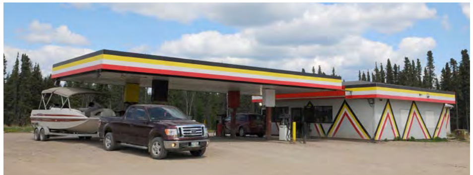
OT Gas Bar demonstrates the company's ongoing success and better meets the needs of customers.

Otohowin Gas represents a window of opportunity for NCN youth by providing jobs that give valuable work experience. This job experience teaches business practices and demonstrates the importance of hard work, ethics and interpersonal skills in the workplace.