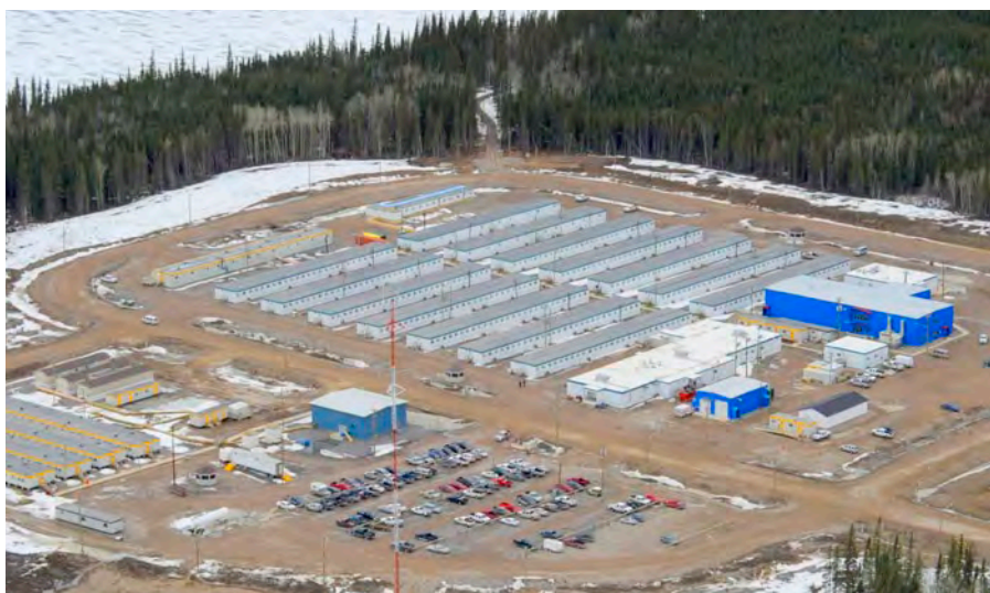
The Wuskwatim construction camp has potential for converting the existing facilities into a Corrections Canada Healing Lodge, once Wuskwatim construction is complete.

Once the Wuskwatim Project is completed, the well-equipped construction camp that houses over 700 project workers will no longer be needed and will be decommissioned. No decision has been made regarding disposal or use of the assets. The Nelson House Development Corporation has proposed to NCN, Chief and Council, Manitoba Hydro, and Corrections (Continued on page 6)